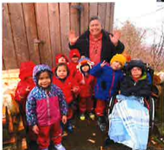
Salmon food preparation at Eke me-xi