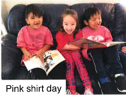
Pink shirt day