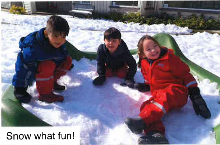
Snow what fun!

Gilakas'la! What a wonderful February we've had. Our salmon eggs hatched and are now fry, we will release them to the Quatse River after spring break. This month was filled with lessons of love and, learning about salmon and eagles. This cold snap has really been nice for the kids to have fun in the snow. However, we are looking forward to all of the new life and warmth that spring will bring.