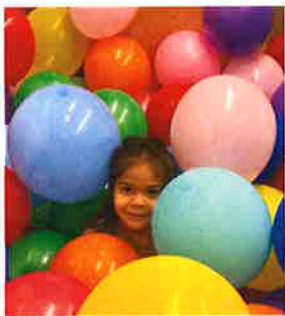
Balloon room fun!