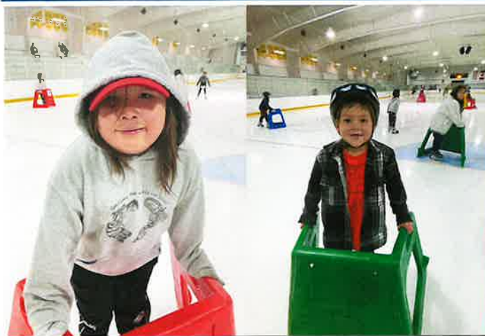
School-wide skate and Outdoor learning. Making winter homes for our mice.