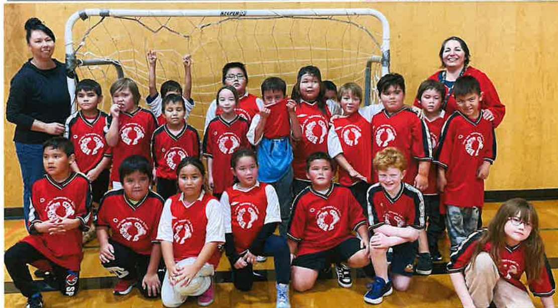
Soccer Tournament - Grade 2/3 on Wednesday and Grade 4/5 on Thursday! The students demonstrated team work, camaraderie, and sportsmanship. They represented our school proudly and had the most fun!

Quote of the month "Kindness is heard, felt, and seen. It uses all of our senses!" Learning to play rhythms in music Class, using a variety of instruments!